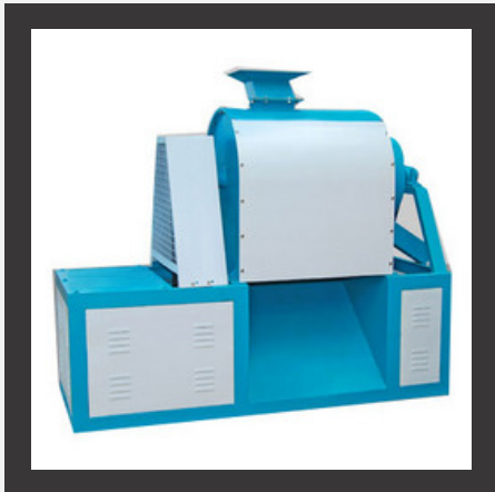
Cage Miller Machines