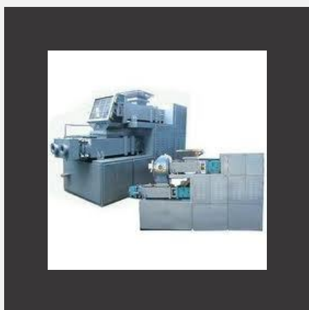
Single Worm Duplex Vacuum Plodder