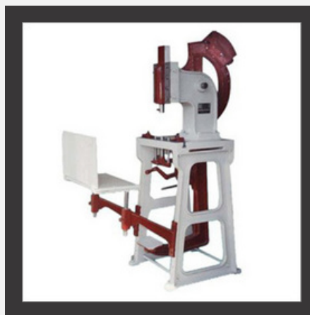
Soap Stamping Machines