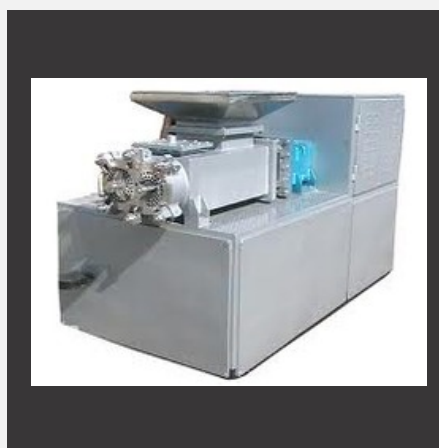
Twin Worm Simplex Plodder