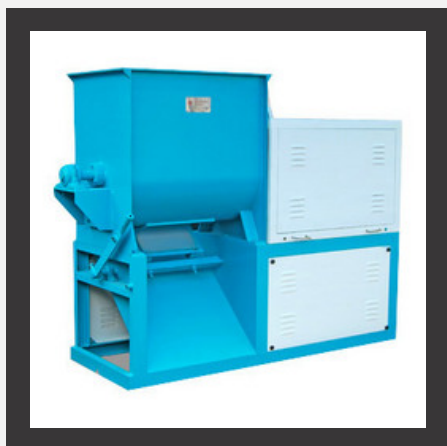
Washing Powder Mixing Machines

Avail from us a comprehensive range of Powder Mixing Machine that is widely acknowledged for preparing "Free Flowing Detergent Powder". This range is manufactured from quality raw material with latest technology incorporated in main drive system and inclined mixer arms.