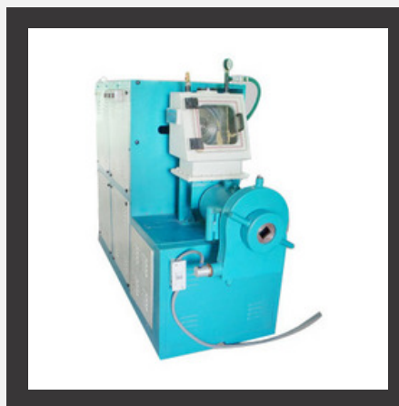
Duplex Plodder Machines