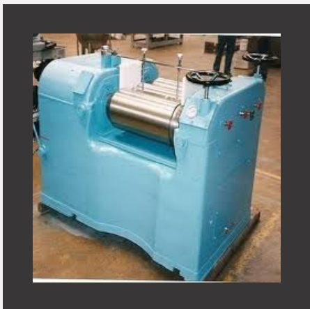
Triple Roll Mill