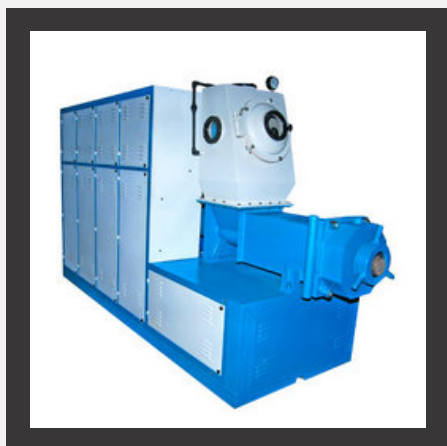
Vacuum Plodder Machines

This plodder machine is widely used for manufacturing toilet soaps and detergents. Our precision engineered and optimum performance plodder machines are available in various sizes, specifications and are appreciated for durability.