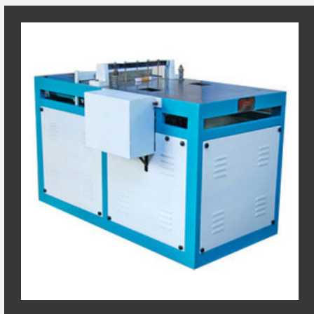
Soap Cutting Machines