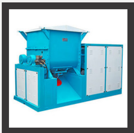
Detergent Soap Mixing Machines

Our range of soap making machinery includes duplex plodder machine, cage miller machine, vacuum plodder machine, washing powder mixing machine, detergent soap mixing machine, triple roll miller machine, sap stamping machine and soap cutting machine.